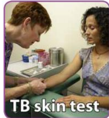
TB skin test

Protect your family and friends from TB — take ALL your TB drugs!