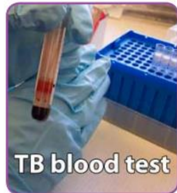
TB blood test